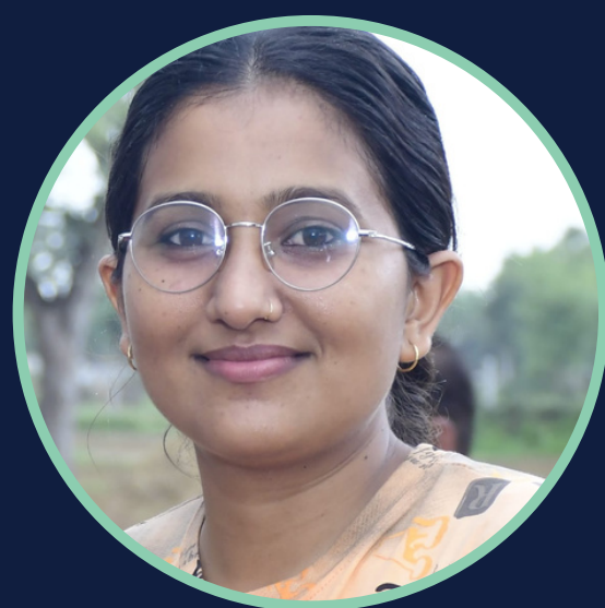
Anita AIR- 1679 Batch- 2019